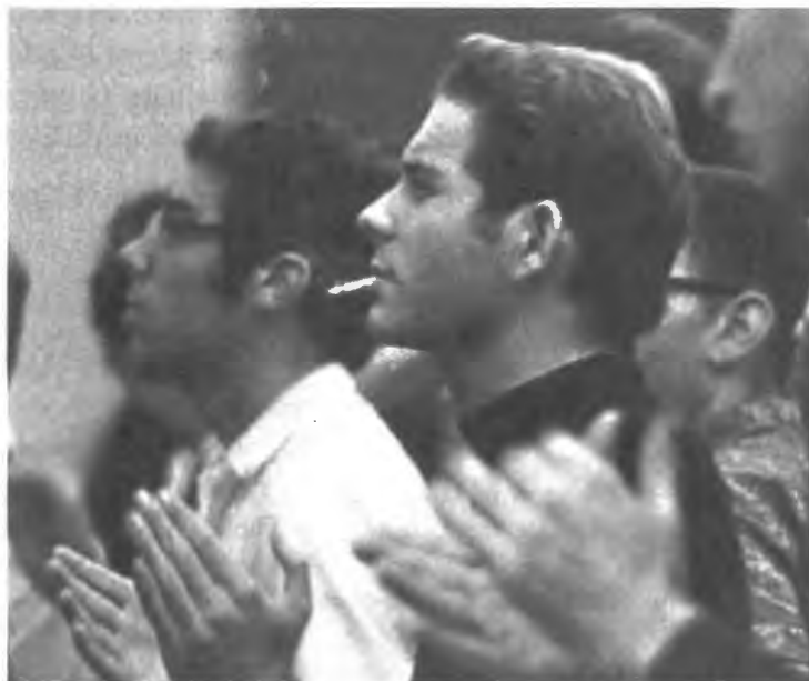
The author, during the Free Speech Movement.

One of those topics was the university itself—its historic purposes and contested character, and it is the topic I will address here. And yes, it was in the plaza that this subject first came up for me, not the classroom. It came up there partly because of the protests we were engaged in, and partly because Kerr's just-published Uses of the University made a number of claims about the institution that were widely celebrated—though not by students on the campuses of the country. My understanding of the university was extended in evening colloquia and panels with campus faculty. There were no formal courses about the institution despite its long and rich history and despite it being the place we were all gathered, working together. Classrooms still neglect the topic, I think, today. Those arguments in the plaza and presentations on the panels were the first places I heard about the origins of the university in 12th century Bologna and Paris, about things like the liberal arts and academic freedom, of names like Cardinal Newman, Robert Hutchins, and James B. Conant, or of the fact that the Puritans established Harvard, the nation's first higher education institution as early as 1636.